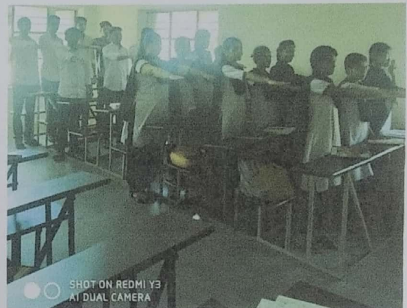
3 rd sem Civil students taking oath

Fit India movement is a nationwide movement in India to encourage people to remain healthy and fit by including physical activities and sports in their daily lives. We have given awareness about "Fit India Oath" to SLNCER students on 30-08-2019. It was launched by Prime Minister of India Narendra Modi at Indira Gandhi stadium at New Delhi on 29 AUG 2019 (National Sport Day). The campaign has a "Fitness pledge" that leads "I promise to myself that I will devote time to physical activity and sports every day and I will encourage my family members and neighbours to be physically fit and make India a fit nation". It was important day that we had conducted to our BE students. Total of 54 students took participation.