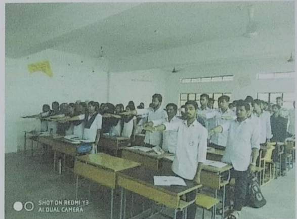
1 st sem students taking oath